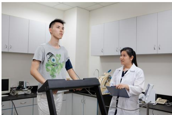
Exercise Science Laboratory