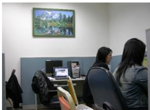
Study room for Graduate student