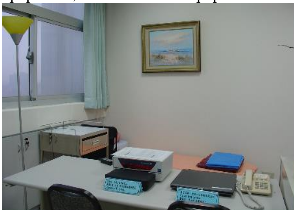
Cognitive Behavioral Laboratory

According to the research attributes, the laboratories are divided into the following four categories: the Health promotion laboratory, Cognitive-behavior laboratory, Exercise science laboratory, and Bio-behavior laboratory. Currently, there are a total of 38 teaching equipments, and 74 research equipments.