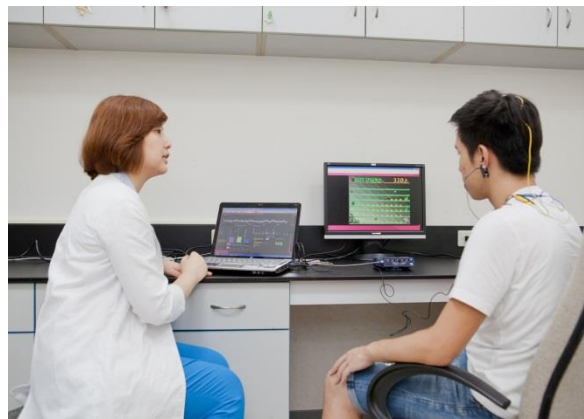
Health Promotion Laboratory