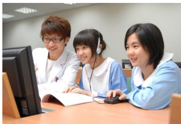
E-teaching and learning environment