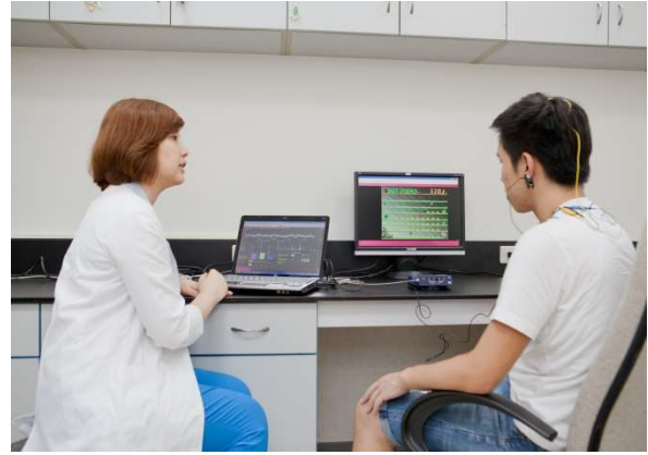
Health Promotion Laboratory