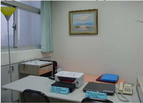
Cognitive Behavioral Laboratory

According to the research attributes, the laboratories are divided into the following four categories: the Health promotion laboratory, Cognitive-behavior laboratory, Exercise science laboratory, and Bio-behavior laboratory. Currently, there are a total of 38 teaching equipments, and 74 research equipments.