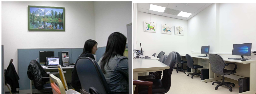
Study room for Graduate student