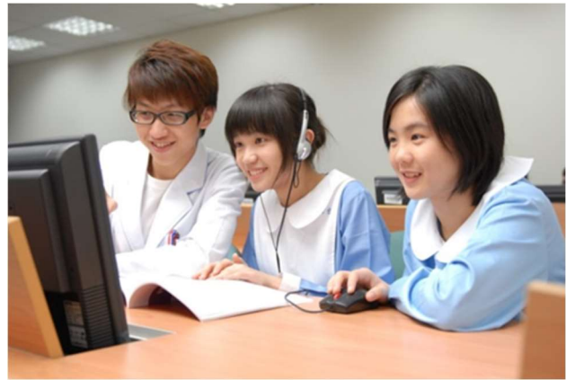
E-teaching and learning environment