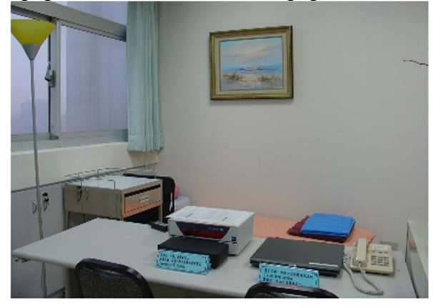
Cognitive Behavioral Laboratory

According to the research attributes, the laboratories are divided into the following four categories: the Health promotion laboratory, Cognitive-behavior laboratory, Exercise science laboratory, and Bio-behavior laboratory. Currently, there are a total of 38 teaching equipments, and 74 research equipments.