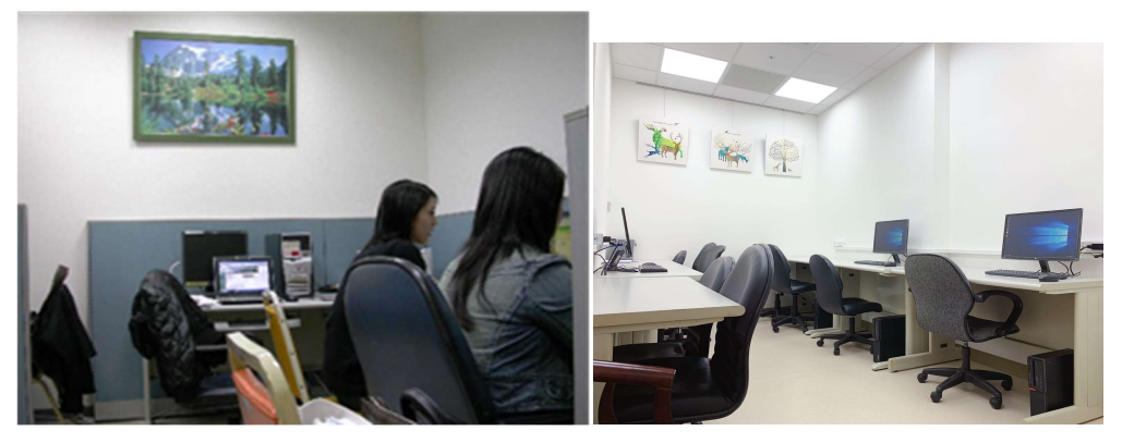
Study room for Graduate student