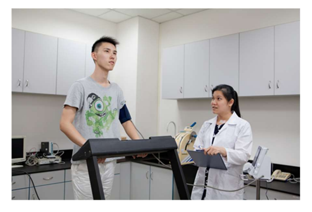
Exercise Science Laboratory