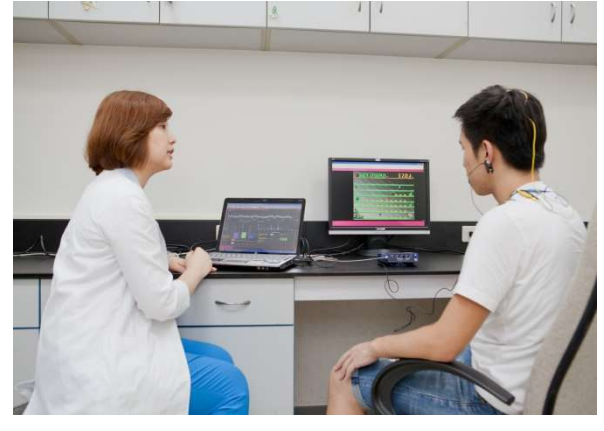
Health Promotion Laboratory